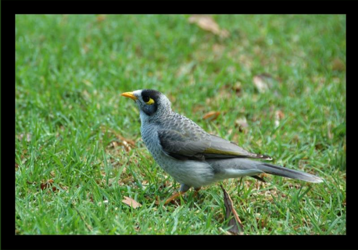
Noisy Miner: mitigation for Regent Honeyeater