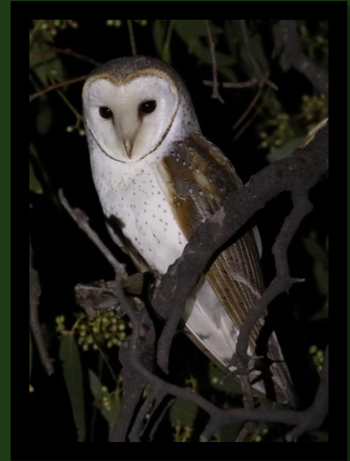
Masked Owl: eradication for oceanic birds (LHI)